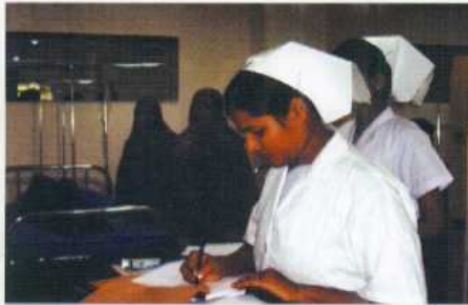
Duty Nurses at Emergency