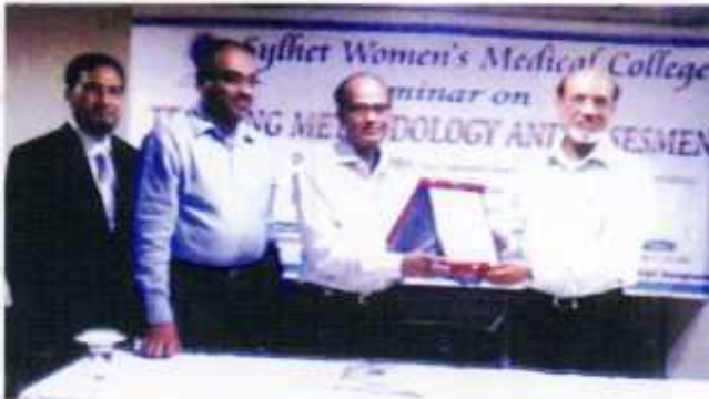
Seminar on Teaching Methodology & Assessment