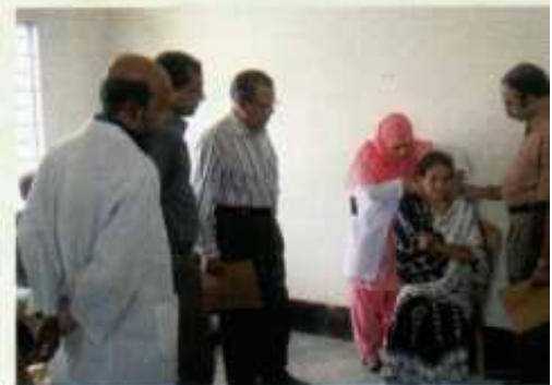
A view from final professional MBBS examina