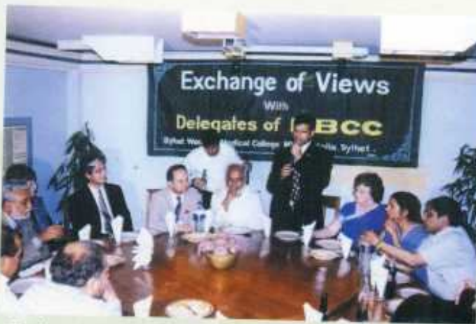
Exchange of views with delegates of British-Bangladesh Chamber of Commerce