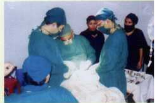
Free plastic surgery (Cleft Lip) project for the under privileged