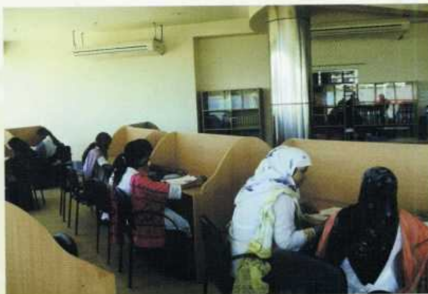
Student's are studying in the library

The Library's mission is to acquire, organize, and facilitate access to knowledge-based biomedical information resources that enable Sylhet Women's Medical College students, faculty, physicians, and other health care providers to advance their education, research, or patient care activities at the Sylhet Women's Medical College. SWMC library is fully air conditioned. It is enriched with good collection of latest edition of books to meet the need of students & teachers. Text, reference book, medical journals of different discipline, internet facilities are available. The library remains open from 8.00 a.m. to 8.00 p.m.