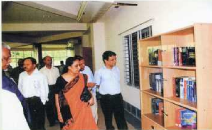
Visiting BM&DC Team in Teachers library