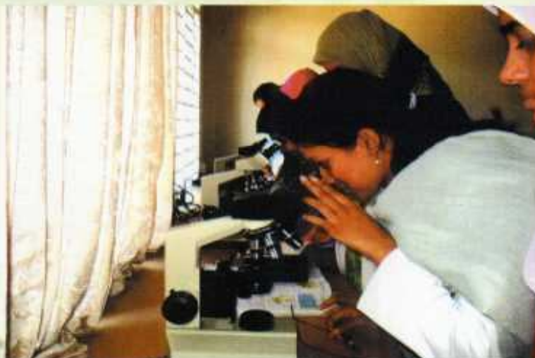
Physiology Experimental Room