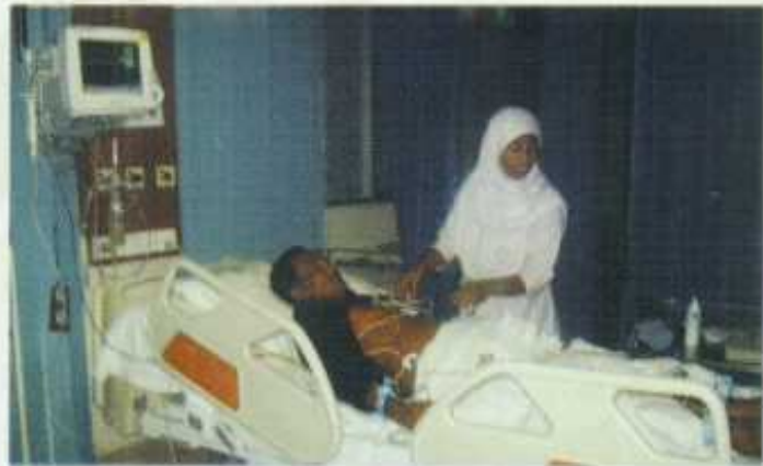
Intensive Care Unit (ICU)