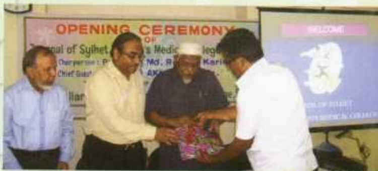
Unveiling of the Journal of Sylhet Women's Medical College