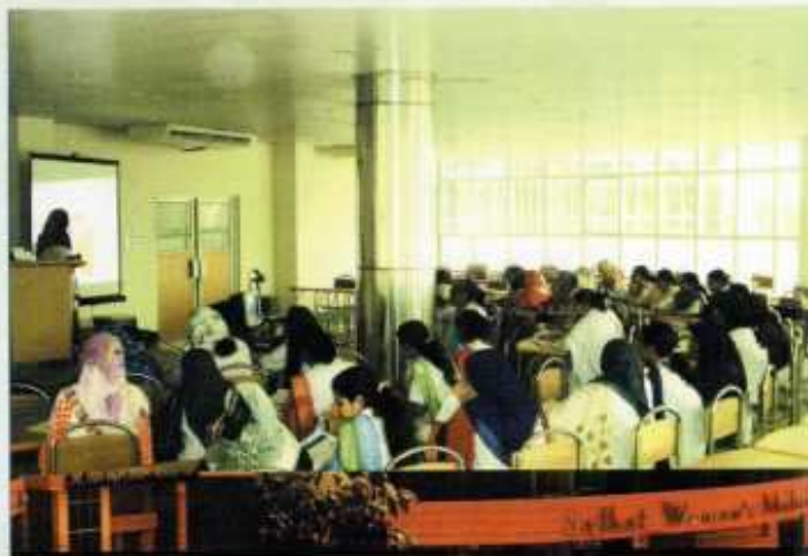
State of the Art Lecture Gallery